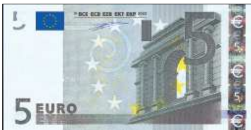
Note of 5 Euros Motif of Robert Kalina

Classical art can be classified in three main styles : Ionic, Doric and Corinthian. It was born in Greece and was handed down to Rome. The contrast between the styles is elaborated to create an aesthetic effect. The buildings, the Propylaea, are the monumental doors found in ancient Greek temples and were usually made of white marble. The architectural forms such as the friezes and mouldings, are painted in lively colours.